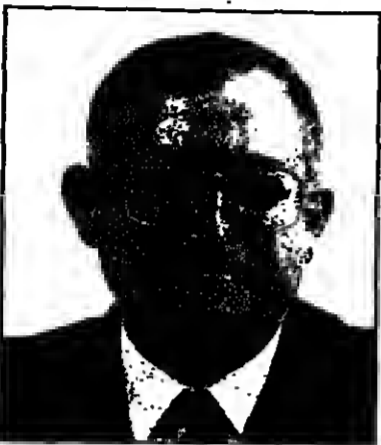
Prof. Yoram Dinstein

"What if one side has smart bombs and the other doesn't?" Dinstein asks. "Smart bombs might be too expensive, or one side can claim that why should it use smart bombs when the other side doesn't?"